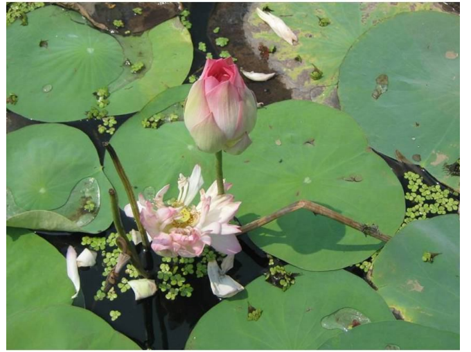
Fig. 1. Nelumbo nucifera in its natural habitat.

Leaves of N. nucifera were collected from ponds in different localities of Tirunelveli and Nagercoil, Tamil Nadu between Dec 2011 to Jan 2012 (Fig. 1). Leaves were shade dried and dried parts were powdered using mechanical pulverizer and subjected for extraction.